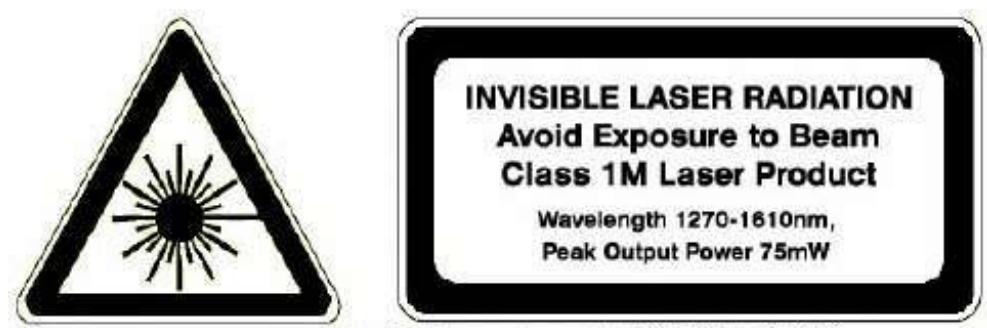
classified in accordance with IEC 60825-1: 2001-08.

Caution: use of controls or adjustments or performance of procedures other than those specified herein may result in hazardous radiation exposure.